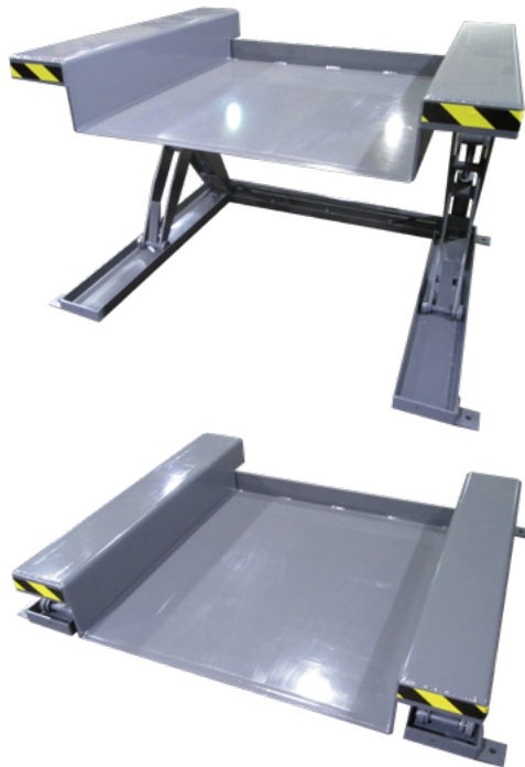
Ground Level Scissor Lift raised position (top) and lowered (bottom)

JMP Solutions' GLSL ground level "drive on - drive off" access for pallet trucks & dollies and does not require a pit. The GLSL is a rugged unit, perfectly suited for all types of ergonomic applications & lifting jobs, offering years of maintenance-free service.